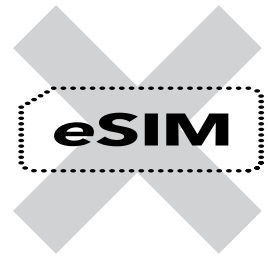
Don't distort the icon