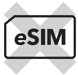
Don't alter the SIM shape rendering