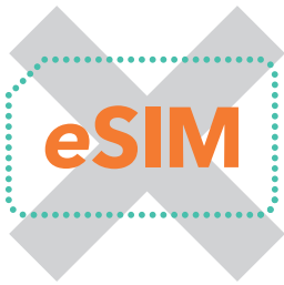
Don't recolour separate elements

Always use the icon as it is supplied, using the correct digital master artwork and appropriate file format. Do not recreate or redraw the icon.