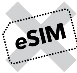
Don't rotate the icon