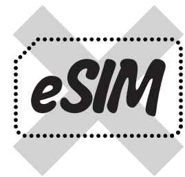
Don't develop new versions of the icon